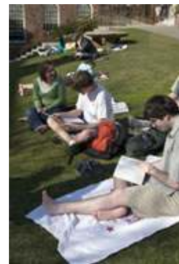
Students studying outside at Brown University

Life Science Research: Seven hospitals in metropolitan Providence area are affiliated with Brown's medical program as "teaching hospitals". An $8 million bio-medical building completed in 1969 serves as the on-campus center for the medical programs. Two new buildings have been added to the campus in the couple years to yield the demand of medical research done by the University.