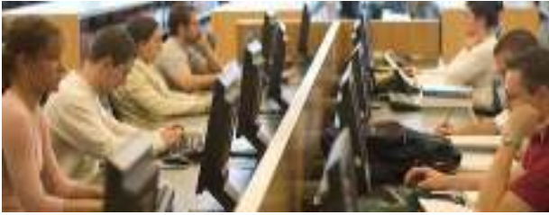
Students working hard at Bryant's recently renovated library

The modern and functional "unistructure" building houses most administrative and academic functions under one roof. The unistructure features a two-story Plexiglas-domed rotunda. The Bryant University seal bears the motto, "Education for Business Leadership" and was founded in 1863. The