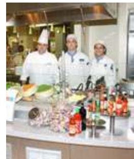
When it comes to culinary, JWU focuses on hands on learning

The University boasts of being the largest, most diverse and successful university for tourism. Johnson & Wales is a coeducational institution offering multi-level college courses in the business and culinary arts fields. One-year, two-year, and four-year programs prepare young men and women to enter the business world with a sound foundation in their chosen careers. Three other campuses located in Florida, Colorado and North Carolina allow the University to reach out to those nationwide.