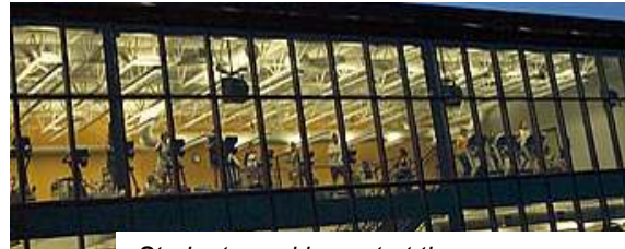
Students working out at the campus gym

Roger Williams University boasts 23 buildings including, a recreation center, performing arts center, and a waterfront residence complex. Its completed library provides 180,000 volumes and the most recent information retrieval system.