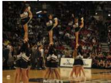
PC Cheerleaders supporting their Division I Basketball team

Providence College seeks to accomplish these goals within the atmosphere provided by a unique catholic educational tradition of the Dominican Order and reserves to itself, the right to formulate policies consistent with that tradition. Welcoming qualified male and female students of all religious and ethnic backgrounds, the College promotes the pursuit of sound principles of the Judaeo-Christian heritage.