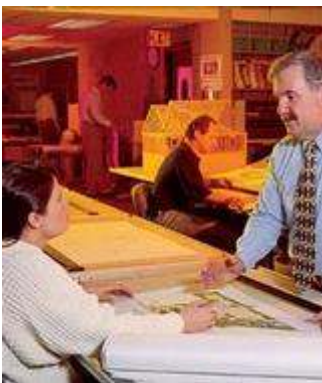
A typical class at NEIT

For over sixty years, New England Institute of Technology has met the challenge of preparing its graduates to enter an increasingly competitive workplace. Founded in 1940 as the New England Technical Institute, the present college began as a certificate-granting trade school. In 1971, a new administration envisioned a degree-granting institution that not only would be better qualified to meet industry's need for technically trained workers, but also would become one of the top technical colleges in the nation.