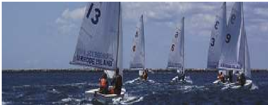
University of Rhode Island Sailing Team

Division of Engineering Research and Development: This division was established in 1942 to coordinate the research activities of the College of Engineering. It disseminates the results of basic or fundamental investigations; conducts fundamental and applied research projects; provides opportunities for graduate students and higher qualified undergraduates to participate in research studies; and offers opportunities for member of the engineering faculty through research to keep abreast of advances in the profession.