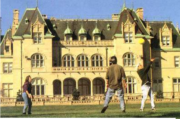
Salve students playing outside one of the many historical buildings the campus has preserved

Recognized as one of the "top ten" small comprehensive colleges in the East, Salve Regina has a continuity of purpose, melding the traditions of the past with an eye towards the educational challenges of the future. The University offers undergraduate degrees including Associate of Arts; Associate of Science; Bachelor of Arts & Sciences; Bachelor of Arts; and Bachelor of Science. Graduate degrees include a Master of Science and a Master of Business Administration.