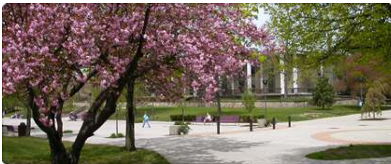
Rhode Island College in the Spring