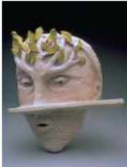
Ceramic art done by a RISD student

The school offers sixteen undergraduate and seventeen graduate degree programs in a full range of fine arts, architecture, and design disciplines as well as masters degrees in nine areas. Accredited by the New England Association of Schools and Colleges, Inc., its professional offerings are balanced by a broad, liberal arts curriculum.