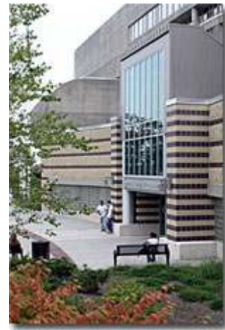
Knight Campus, one of the many CCRI locations in RI

CCRI opens its facilities for public use, sponsors programs on issues of public concern, and offers workshops and seminars for small businesses, government agencies, and for individuals seeking to improve their skills or enhance their lives.